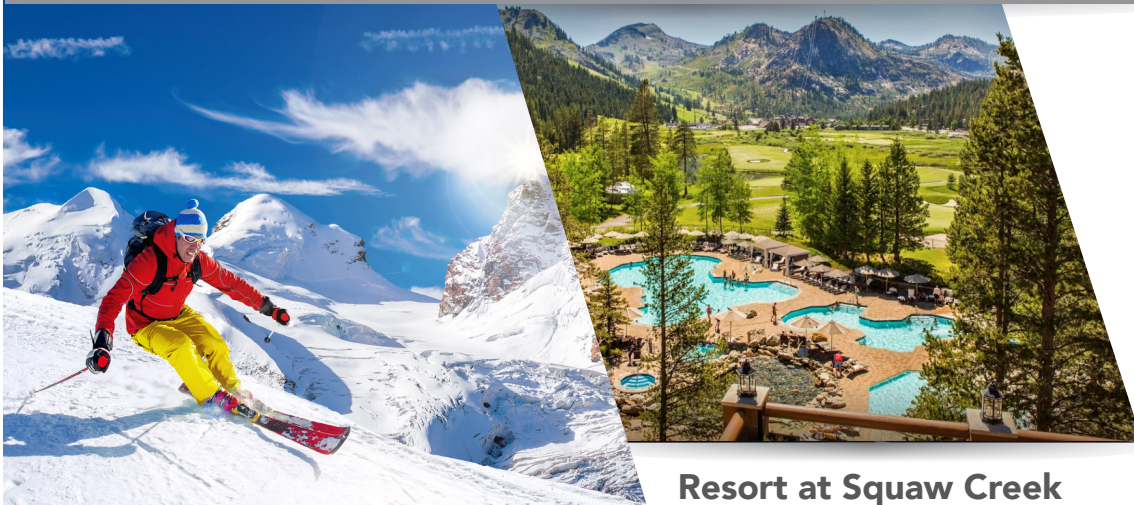
Resort at Squaw Creek Lake Tahoe, Olympic Valley, California